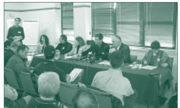
Representatives of families at the press conference held in Montréal last October.

services as well the necessary support for families in distress, for parents as well as brothers and sisters. That is why it is joining the parents who have got together to take a class action with a view to ensuring a better future for their children.