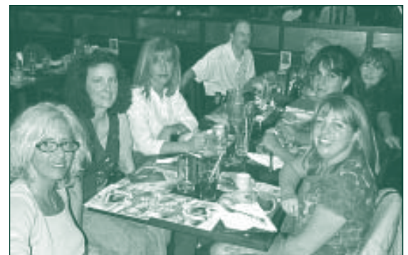
Many parents met for a festive evening in a Montreal restaurant last September.

The popularity of the Federation's Web site and of its discussion panel is increasing incessantly. The month of November has broken all records of hits with a total of 6,633 different visitors. Our statistics also show that, in the month, there were 10,424 hits (i.e. 1,57 per visitor) and more than 89,793 pages consulted. Since the site was launched in October 2001, it has been consulted by people from more than 50 countries.